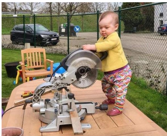
How NOT to babysit your Grand Child!

When was the last time you were able to attend a live performance of a play of this nature?