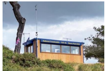
NCI Stone Point